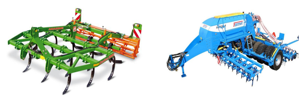
Fig. 4. Tillage cultivator for deep soil preparation

In order to maximize the preservation of soil moisture and provide the most favorable conditions for germination of flax seeds and seeds of perennial grass, the proposed technology provides for sowing flax with a combined sowing aggregate (Fig. 5), combining soil preparation, consolidation of the treated layer and sowing [21;22].