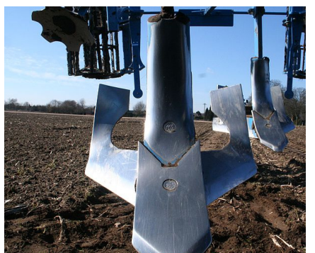
Fig. 2. TriMix paws on stubble cultivator for maximum residues burying

rollers [19]. Rollers provide leveling of the field surface and consolidation of the top layer. The use of such tillage machine allows eliminate the compaction, created by arable aggregates and wheel systems of tractors and farm machinery, leveling the field surface to ensure maximum productivity of subsequent technological operations, and also protect the upper layer of soil from water and wind erosion [20].