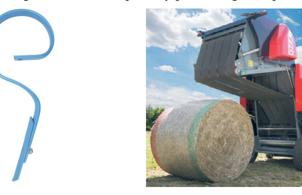
Fig. 6. Straight chisel point on gamma-shaped spring tine

After full maturing, the broken flax is collected by round balers [24;25], which form dense bales and wrap them with a net (Fig. 7). The use of a net for wrapping allows get maximum productivity of this technological operation, ensures safe storage of the broken flax in the bales in open air, and greatly facilitates the unwinding of bales at flax primary processing enterprises.