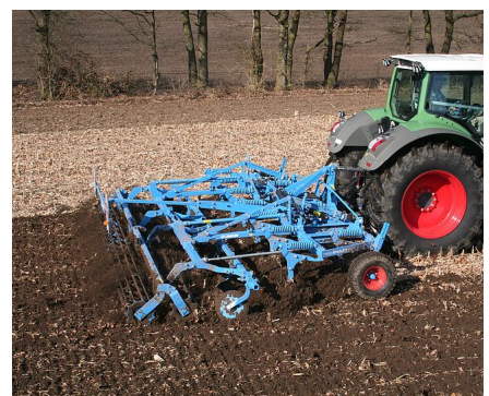
Fig. 3. Stubble cultivator with TriMix paws in work position

To ensure the required plant nutrition regime, the proposed technology provides for the use of wide-spreading mounted or trailed spreaders of mineral fertilizers capable of ensuring a high uniformity of fertilizer distribution at the level of 93-95 %. An increase in the working width of fertilizer spreaders reduces the number of passes of heavy aggregates. On the trails after the tractor and spreader's wheel passes a decrease is observed in the yield and quality of flax due to its sensitivity to soil compaction.